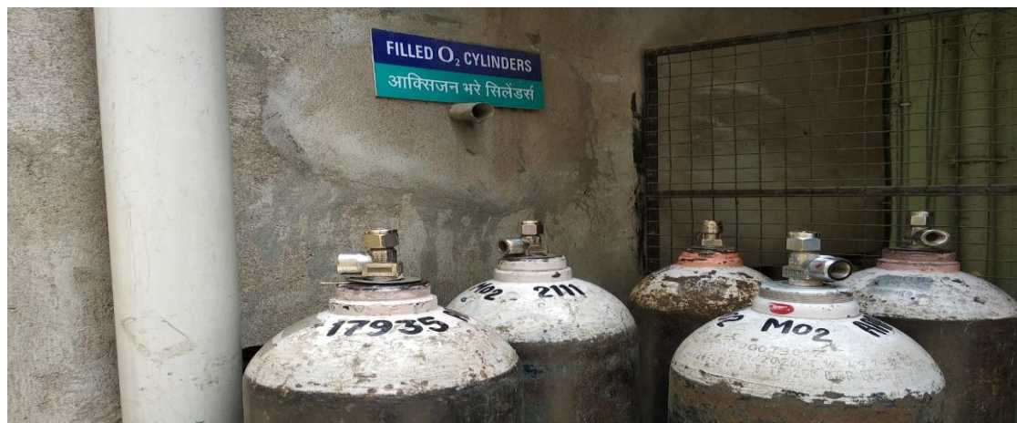
Fig.3 Oxygen Filled Cylinders

In fig. 3 indicate the numbers of cylinder filled with oxygen per day basis. The photographs from Seven Star hospital.