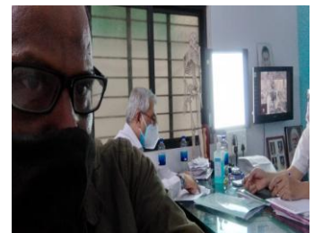
Fig.6 Oxygen cylinder supply Documents verification