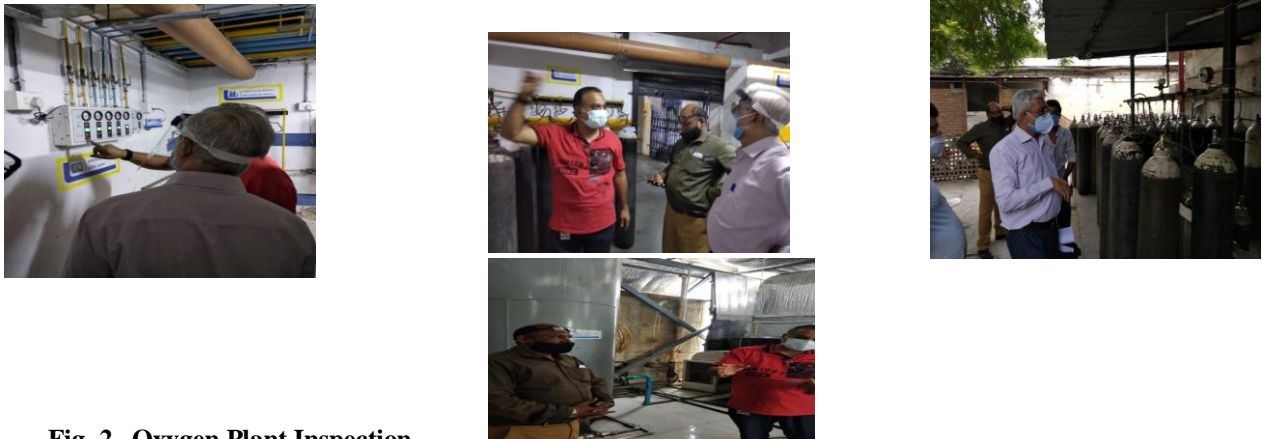
Fig. 2 Oxygen Plant Inspection

In fig. 3 indicate the numbers of cylinder filled with oxygen per day basis. The photographs from Seven Star hospital.