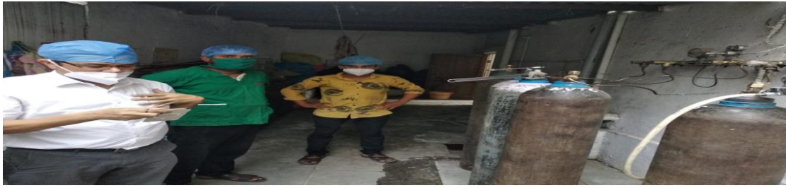
Fig. 5 Oxygen Plant Medical Doctors

In fig. 6 shows document verification in hospital.