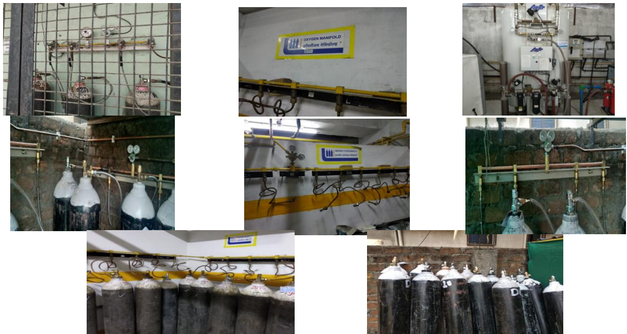
Fig. 1 Oxygen Plant Arrangement

Photographs Shows the actual Observation in Hospital : There are different plant layouts shows in following fig.1 The every Hospital their own layout depending upon the capacity of bed, building arrangement, financial capacity of owner. The arrangements of cylinder, pipeline, safety guards shows in figure. Photographs from hospital which the name indicated in 1.1 Table.